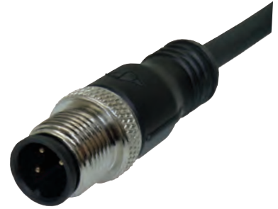
Male 3-Pin version shown above

Canfield Connector is known for its robust connections with an American twist, and the CANFAST® brand of M12 electrical connectors are no exception. This family of robust, all molded anti-vibration electrical connectors for sensors and actuators are specified by those needing a sure connection to valves, sensors, or automation of all types. Available in all industry styles including shielded and unshielded, and in various wire lengths. The CANFAST® round connectors are made in the USA to strict quality standards and are ready for fast delivery.